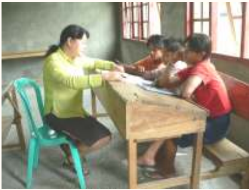
Two teachers share the job to teach 12 youths