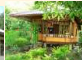
New cottage Cabe